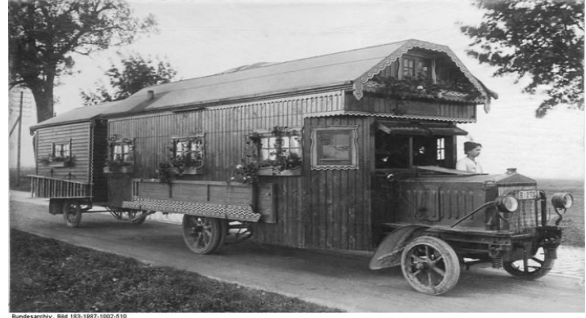
1. November 1922