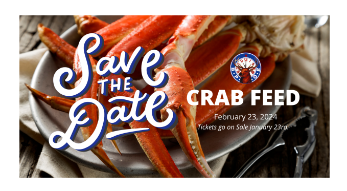
CRAB FEED - SOLD OUT February 23, 2024