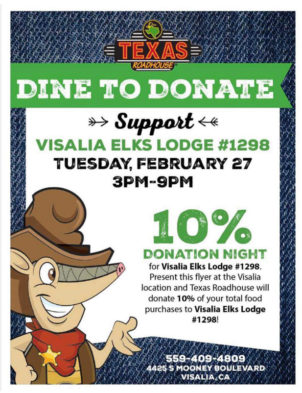
TEXAS ROADHOUSE - DINE TO DONATE - February 27, 2024

If January is the month of change, February is the month of lasting change. January is for dreamers...February is for doers."