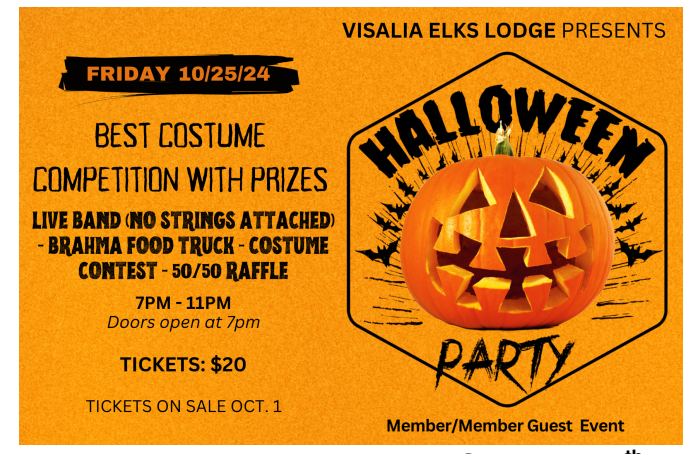
Halloween Party – Friday, October 25<sup>th</sup> Tickets go on sale October 1<sup>st</sup> in the Bar

6<sup>th</sup> Annual Veterans Appreciation Picnic - October 5<sup>th</sup>