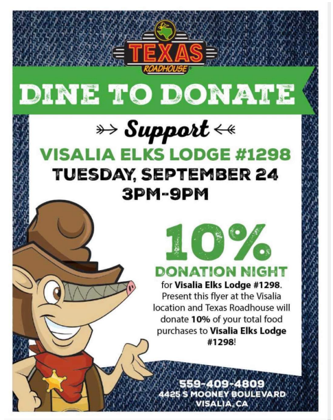
TEXAS ROADHOUSE - DINE TO DONATE – September 24th