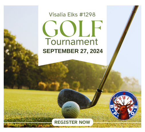
Registration Forms Available in Members FB Group