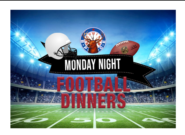
MONDAY NIGHT FOOTBALL DINNERS ARE COMING BACK!! – September 9<sup>th</sup>

Eggs/Omelet bar, Potatoes, Bacon, Sausage, French toast, Pancakes, Biscuits and Gravy 8:30 to 11:00am Adults - $15.00 | Kids under 12yrs - $12 | Veterans - $8.00