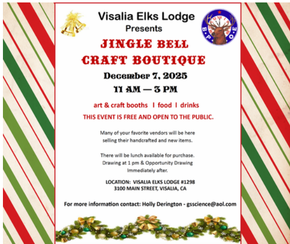
Jingle Bell Craft Boutique Sunday, December 7 th from 11am-3pm