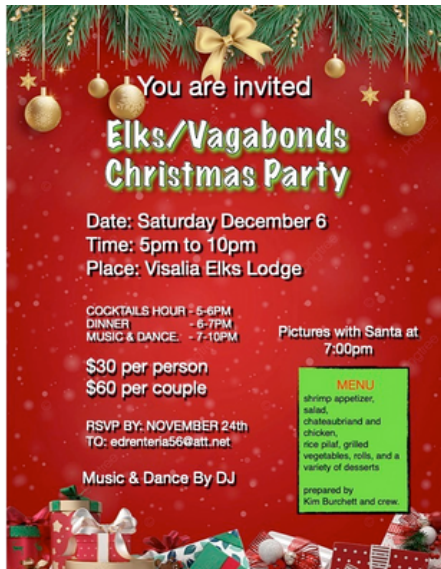
Elks / Vagabond Christmas Party Saturday December 6 th from 5-10pm