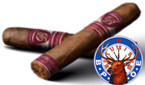
1298 Cigar Club - November 13 th If you enjoy a good a cigar or you're just curious about cigars, this will give members an opportunity to meet once a month. We meet on the 2nd Thursday of each month at 6:30pm.