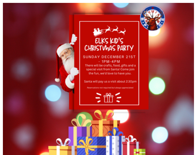
Kid's Christmas Party Sunday, December 21st from 1-4pm