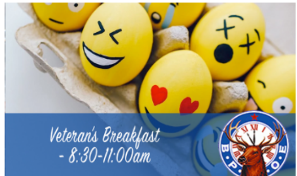
Veteran's Breakfast – December 14 th Eggs/Omelet bar, Potatoes, Bacon, Sausage, French toast, Pancakes, Biscuits and Gravy - 8:30 to 11:00am Adults - $15.00 | Kids under 12yrs - $12 | Veterans - $8.00