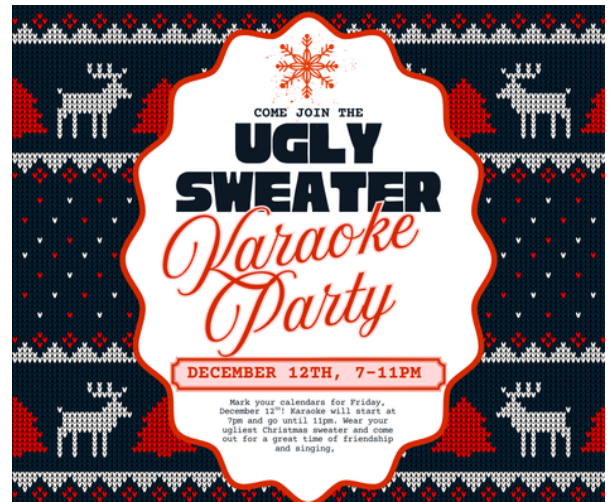
Ugly Sweater Karaoke Party Friday, December 12 th - 7-11pm